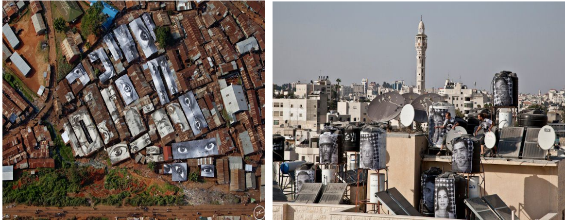
(works of JR in Kibera (Kenya) and Ramallah (Palestine))

A booklet would also be produced that could include the most important artistic results of project, accompanied by a well documented history of the Armenians in Marseille and personal life stories of interviewed people. For this booklet the beneficiaries would contribute themselves, through documentations and writing workshops. In this way, Didac' Ressources's objective of training and providing competences will be achieved as well.